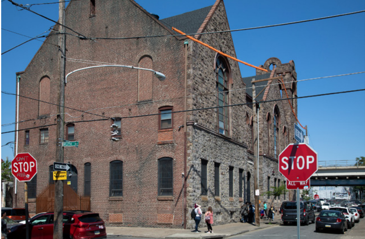
People gather outside Prevention Point Philadelphia on East Monmouth Street.