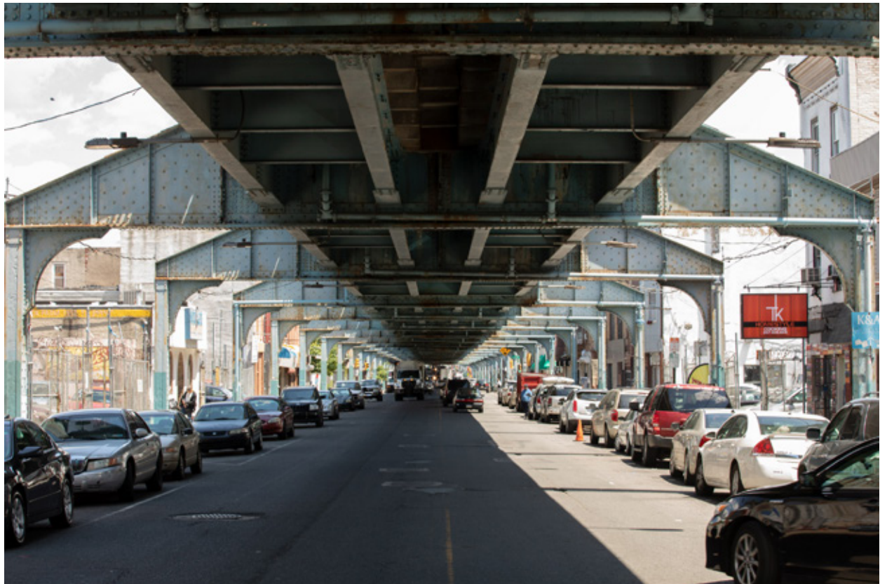
Kensington Avenue, outside Prevention Point